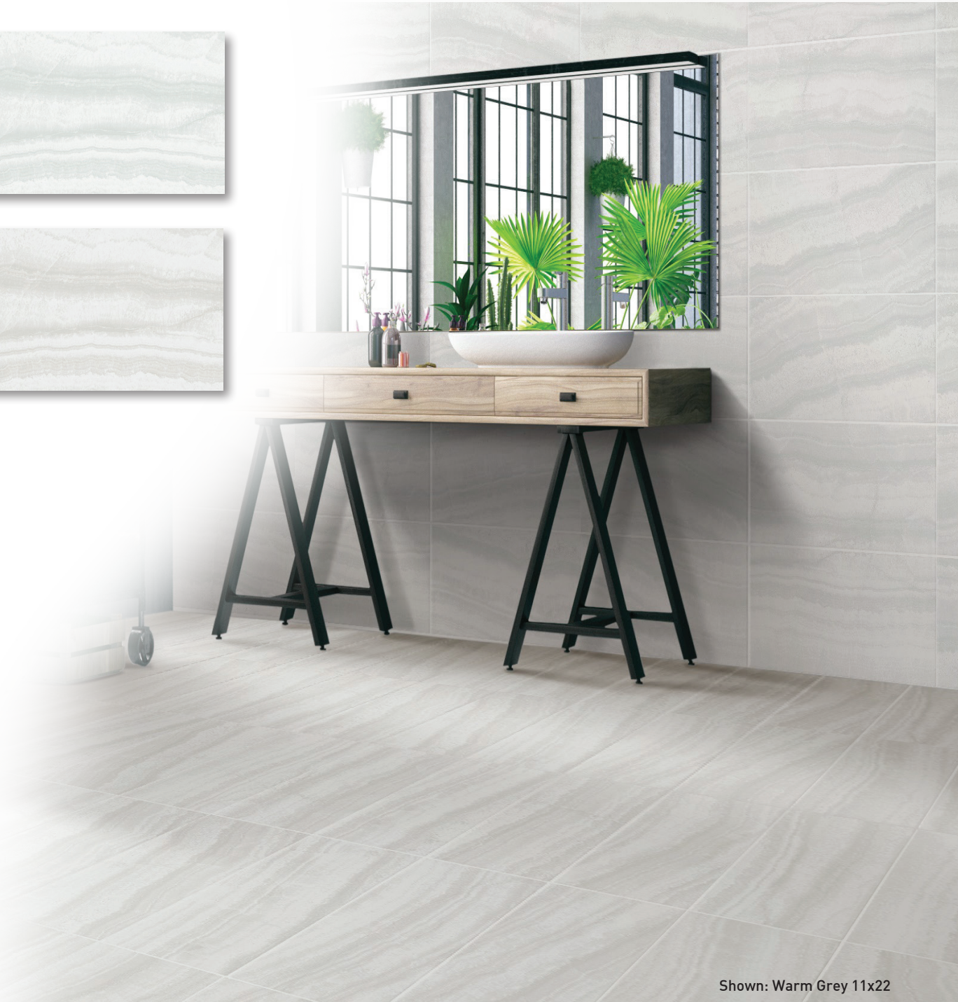
Shown: Warm Grey 11x22