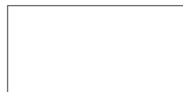
12x24 Textured Outdoor