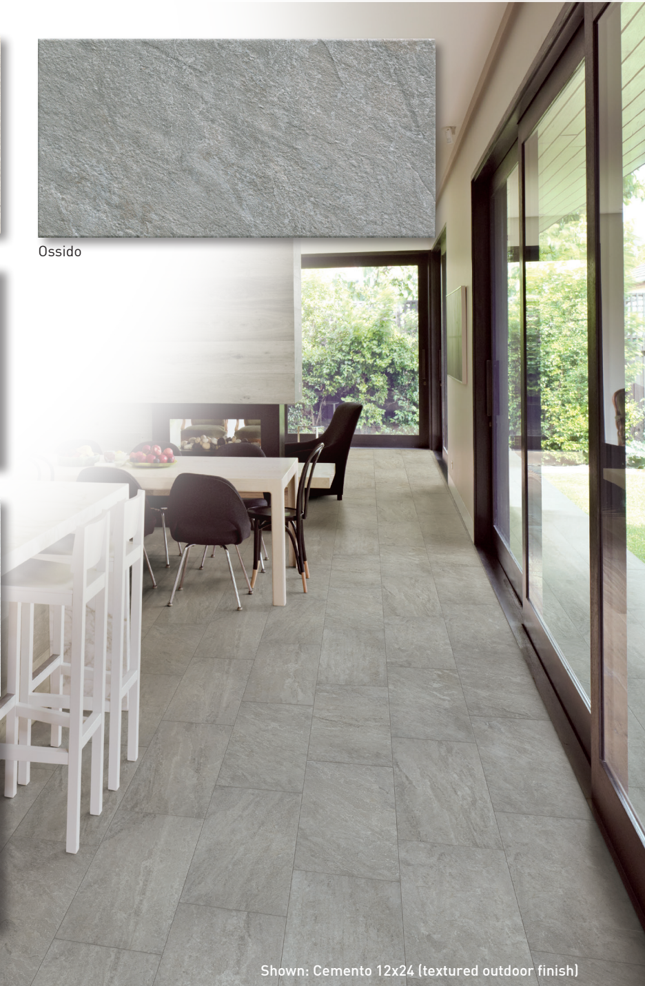
Shown: Cemento 12x24 (textured outdoor finish)