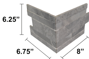
6.75x8x6 Corner* (Available in all colors)