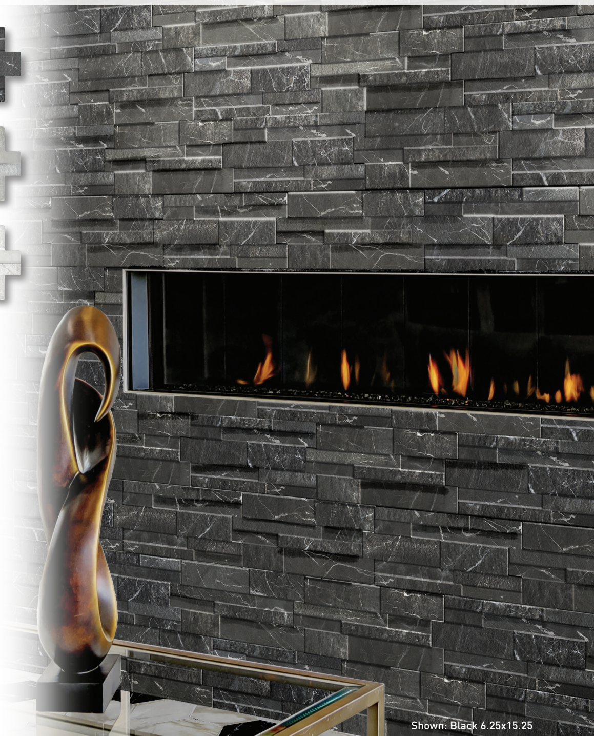
Shown: Black 6.25x15.25