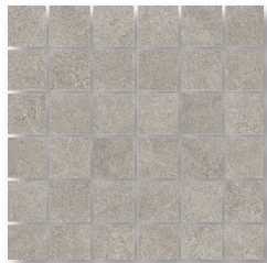
Mosaic (Rock shown)