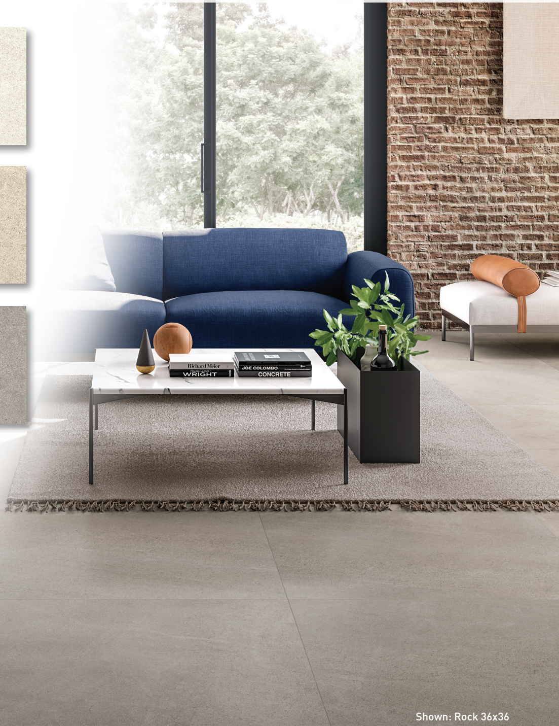
Shown: Rock 36x36