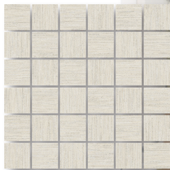
Mosaic (Cotton shown)