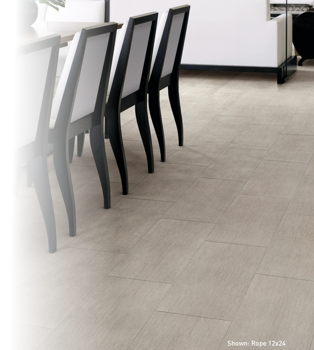
Shown: Rope 12x24

H.D.I.T. HI-DEFINITION INKJET TECHNOLOGY