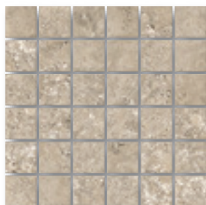
Mosaic (White shown)