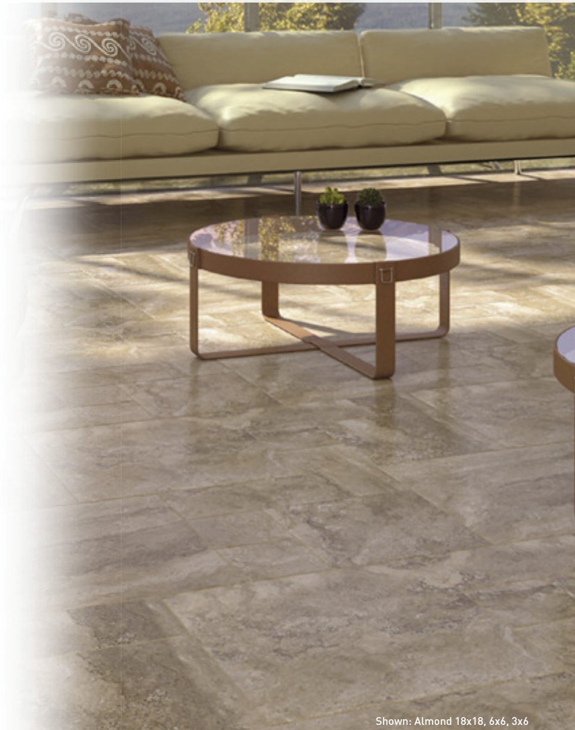
Shown: Almond 18x18, 6x6, 3x6