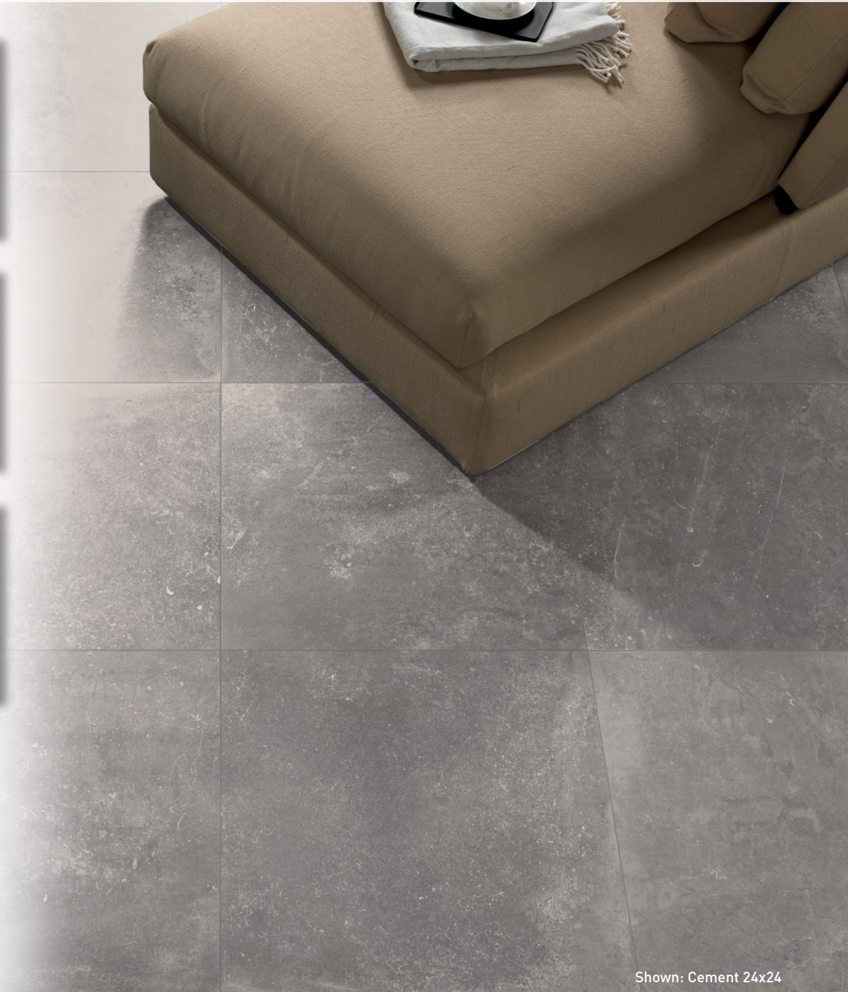
Shown: Cement 24x24