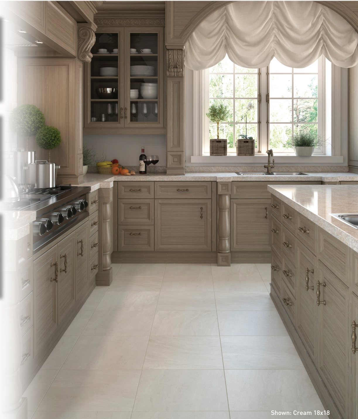
Shown: Cream 18x18